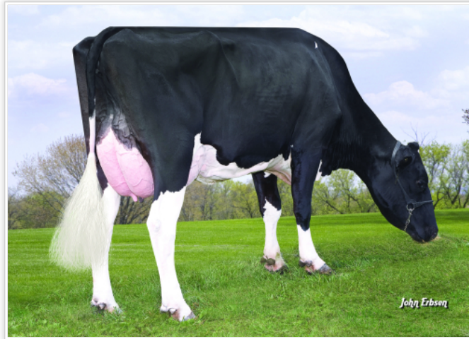
DAM Melarry Zenith M&M-ET